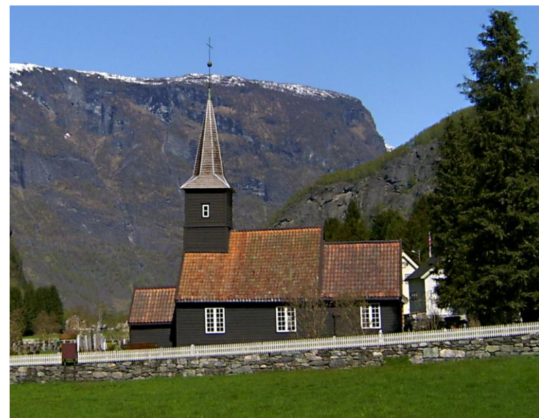
Visit and go inside the Flåm church, built in 1667!

Duration of the trip: 1 hour Price per person: 125 NOK